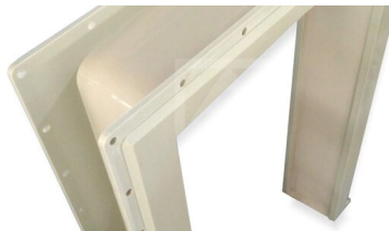
Polystone® P flex