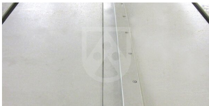
Polystone® P flex